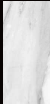
BIANCO 16"x32" RECTIFIED EDGE NATURAL BIANCO 16"x32" RECTIFIED EDGE POLISHED