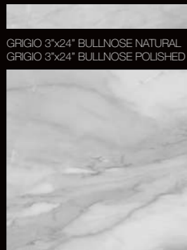
GRIGIO 3"x24" BULLNOSE NATURAL GRIGIO 3"x24" BULLNOSE POLISHED