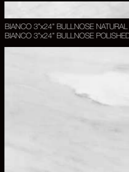
BIANCO 3"x24" BULLNOSE NATURAL BIANCO 3"x24" BULLNOSE POLISHED