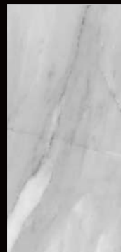
GRIGIO 16"x32" RECTIFIED EDGE NATURAL GRIGIO 16"x32" RECTIFIED EDGE POLISHED