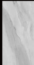
GRIGIO 12"x24" RECTIFIED EDGE NATURAL GRIGIO 12"x24" RECTIFIED EDGE POLISHED