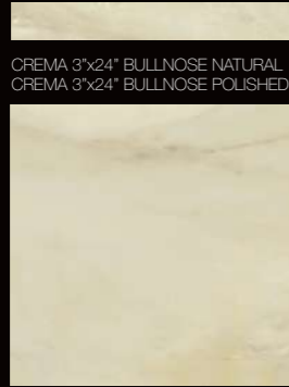
CREMA 3"x24" BULLNOSE NATURAL CREMA 3"x24" BULLNOSE POLISHED