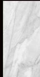
BIANCO 12"x24" RECTIFIED EDGE NATURAL BIANCO 12"x24" RECTIFIED EDGE POLISHED