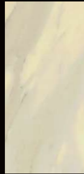
CREMA 16"x32" RECTIFIED EDGE NATURAL CREMA 16"x32" RECTIFIED EDGE POLISHED

GROUT JOINT REQUIRED FOR RECTIFIED EDGE TILE 1/2" BROKEN JOINT NOT RECOMMENDED